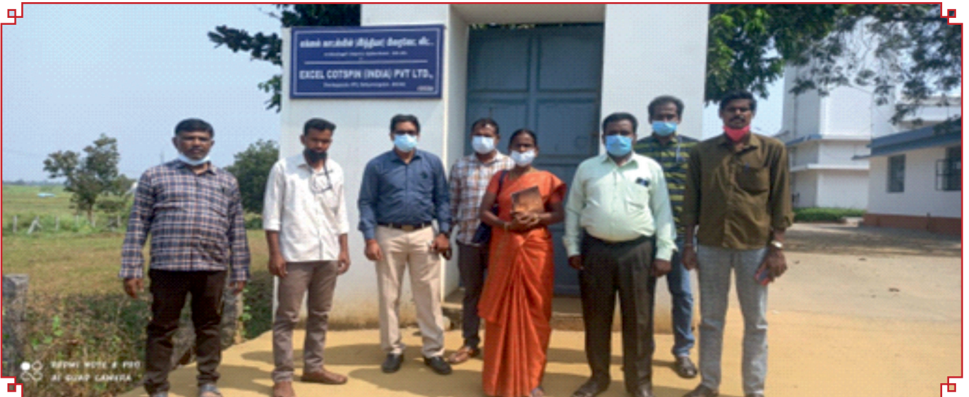
Joint Raid carried out in Sathyamangalam area by DTF for Child Labour