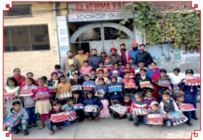
Sweaters and Shoes Distribution in Annual Function