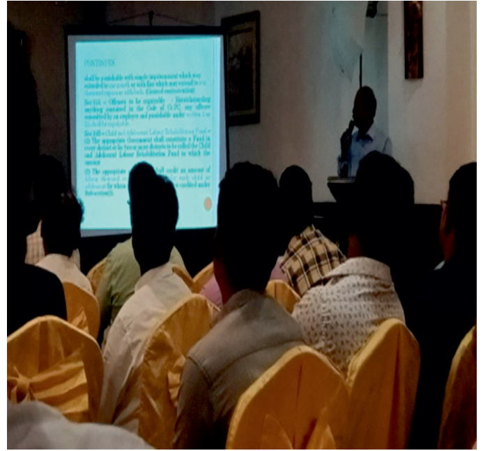
Zonal Level Workshop on Enforcement of CALPR Act