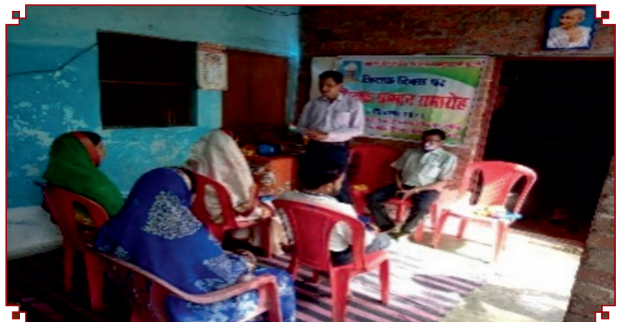
Teacher's Day Programme in Special Training Centres (STCs)