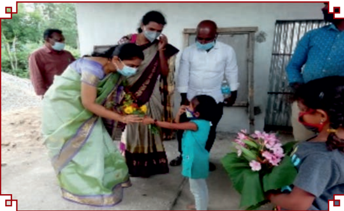
National Child Labour Project (NCLP), Erode, Tamil Nadu