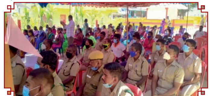
Special health check up and Awareness Generation