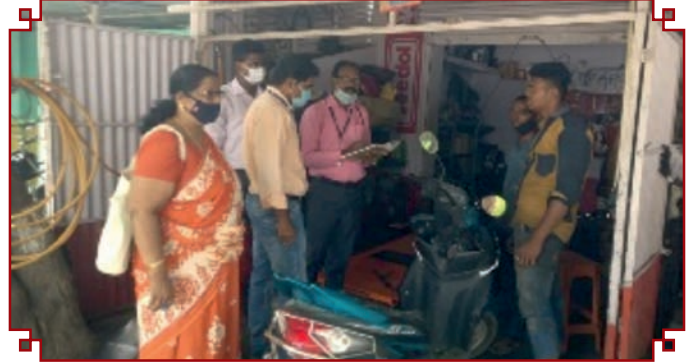
Identification of Child labour