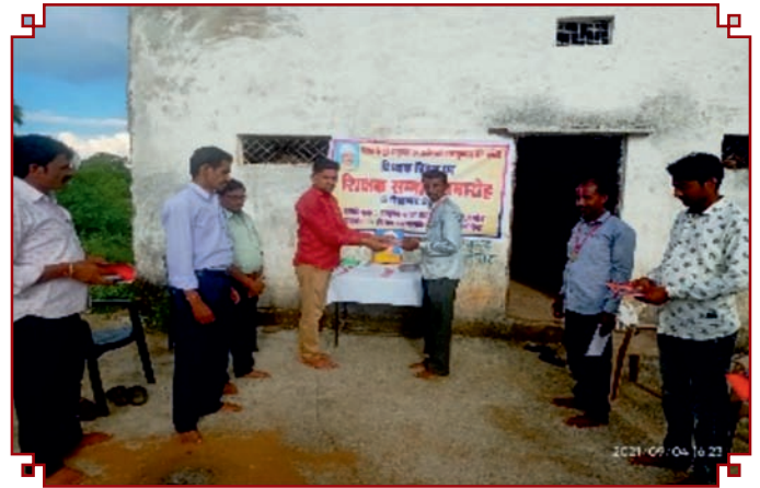
National Child Labour Project (NCLP), Chennai, Tamil Nadu