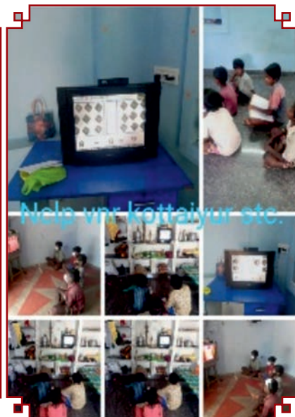
Children Imparted learning on KALVI TV