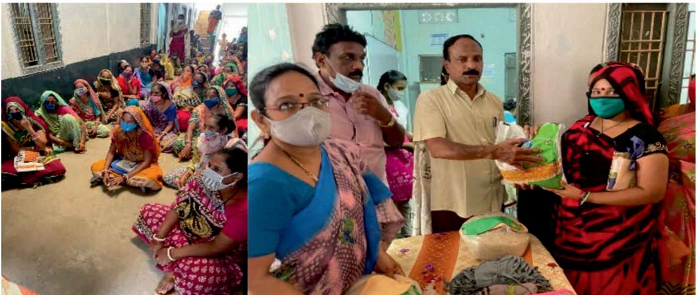
Awareness Programme on Corona and distribution of Pulses and Masks