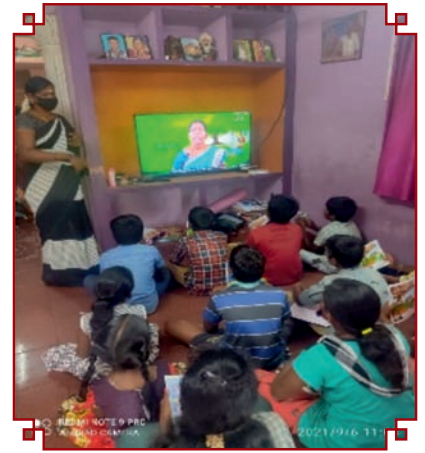
STC Children attending classes