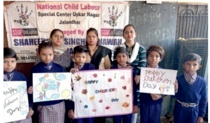
Children's Day Celebration