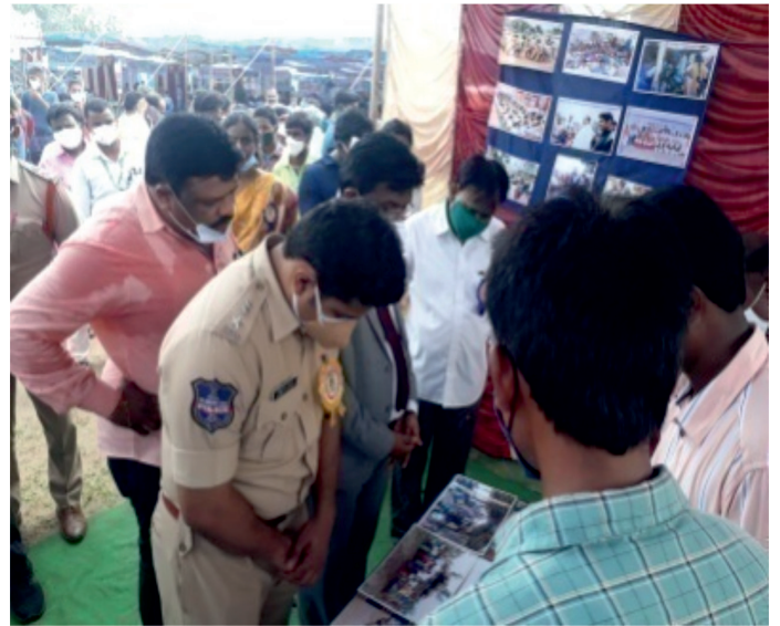
Legal Service Stall Organised by NCLP