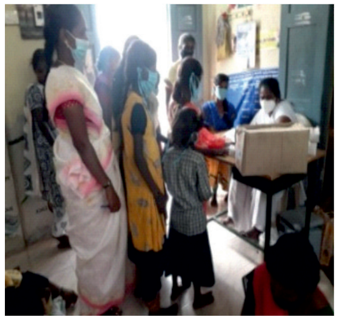
Health Check-up Camp