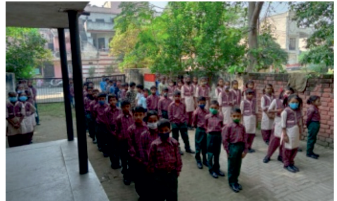
Medical Check-up Camp