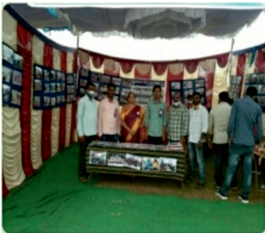
New model legal services Camp attend Judge, DC, CP, and all district officer's. NCLP arrange the stall at Thallda mandal Khammam district Telangana