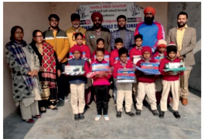
Teachers Day Celebrations