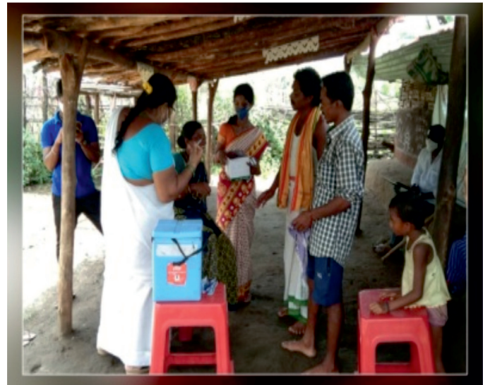
Vaccination Camp Organised by NCLP, Khammam, Telangana