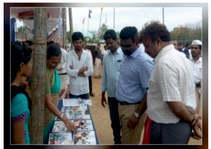
Children's Day Celebrations