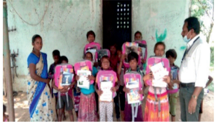
Distribution of Free Text Books