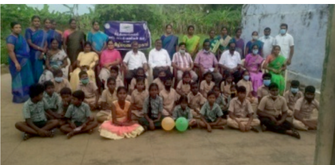
Competitions for STC Students and Prize Distribution