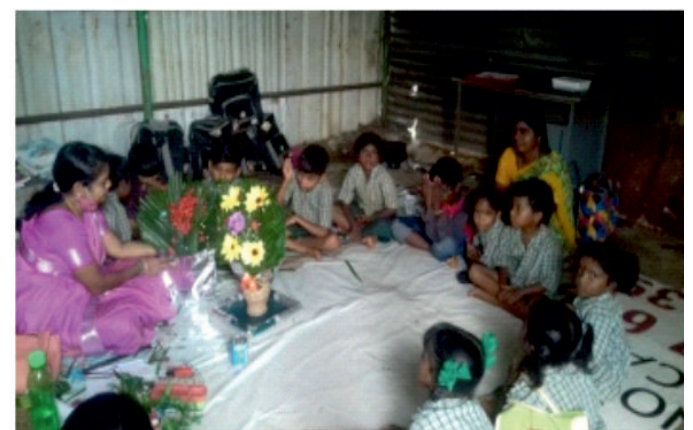
Pre-Vocational Training Camp