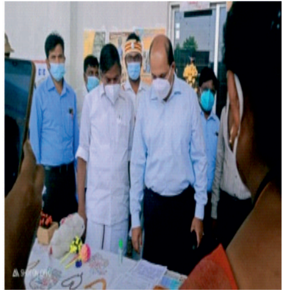
Display of Vocational Training Outcome by NCLP