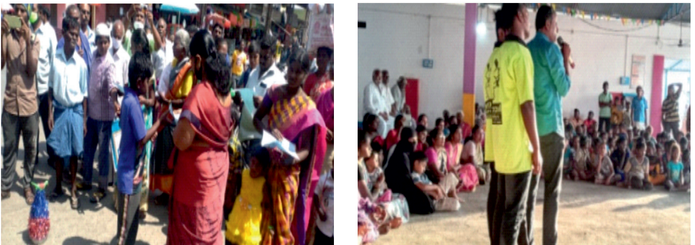
Operation Smile- 2021