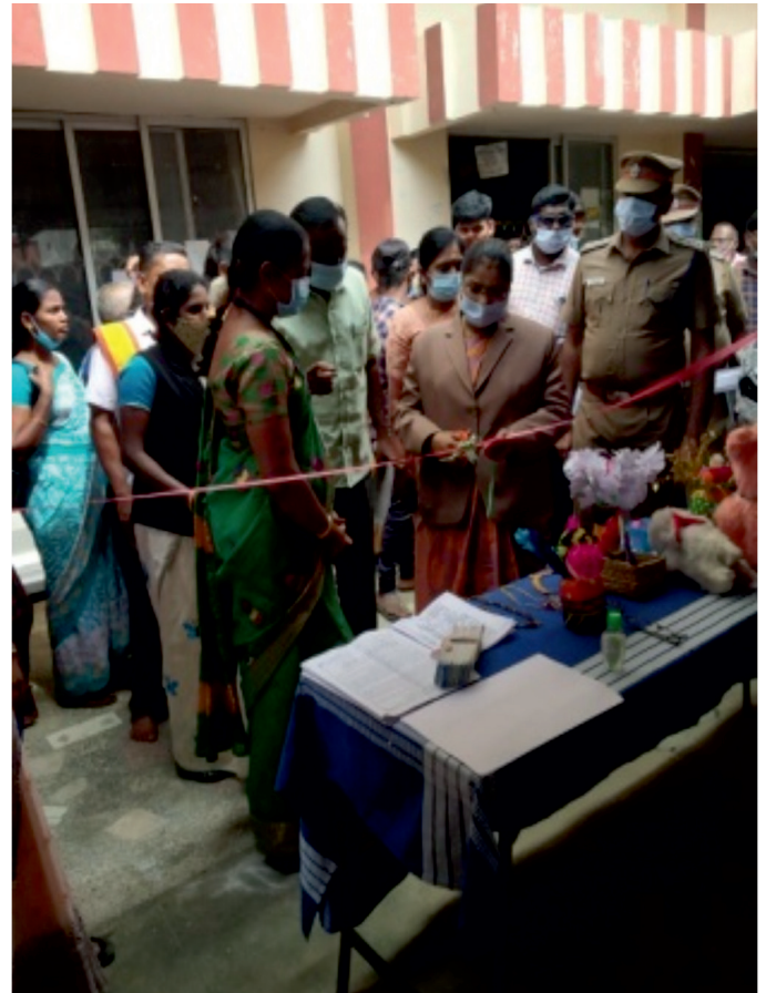
Inauguration of Awareness Programme