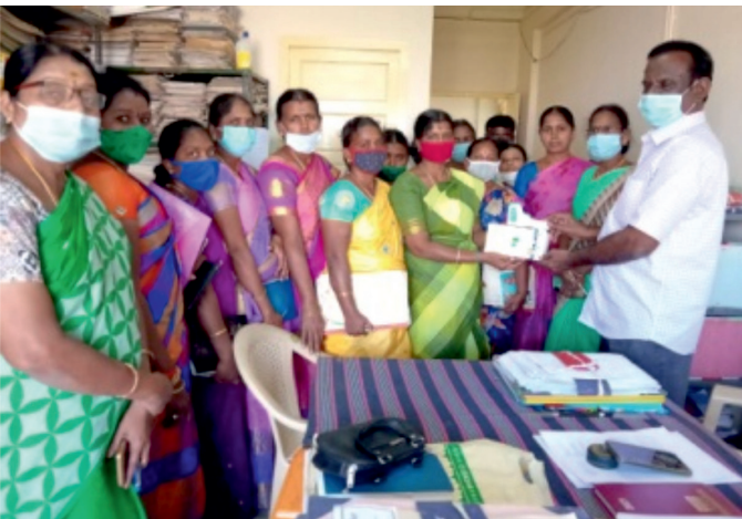
Sponsored 10 Thermal Scanners to NCLP Special Training Centres