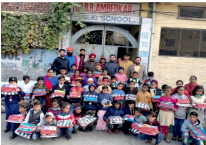
Distribution of the Woolen Jackets