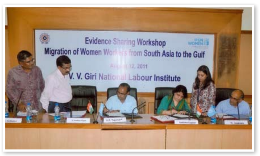
Signing of MoU with UN Women

The major areas of collaborations Germany. include: Child Labour, Health Security, Labour Migration, Social Security, Gender Issues, Skill Development, Labour History, Decent Work, Informal Sector and Training Interventions related to Labour.