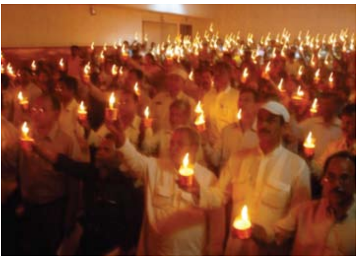
On the occasion of National Anti Child Labour Day on 30th April, 2012, abhiyan song "Le Mashale Chal pade hai log mere Gaon ke" was played and oath was also taken not to employ children by lighting candle