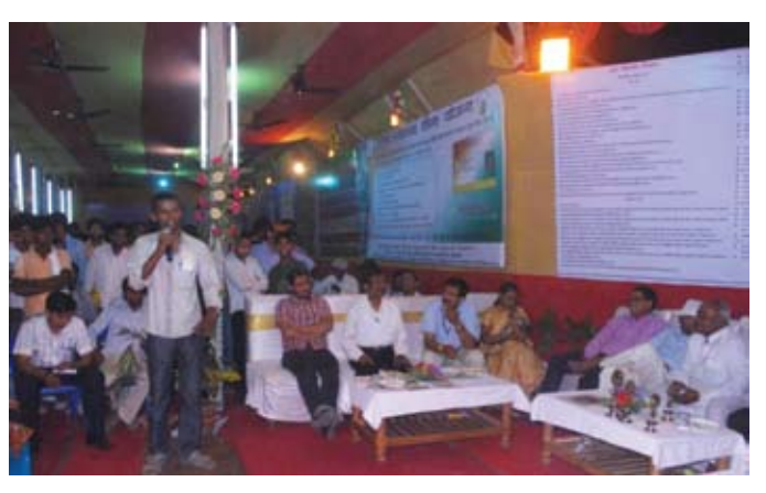
Debate Competition on the topic "Should children be allowed to work?"