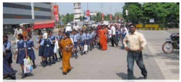
Awareness Generation Rally conducted by Project Society Raipur, Chhattisgarh

Chhattisgarh Labor Welfare Board provided Note Books to 500 NCLP Special Schools children