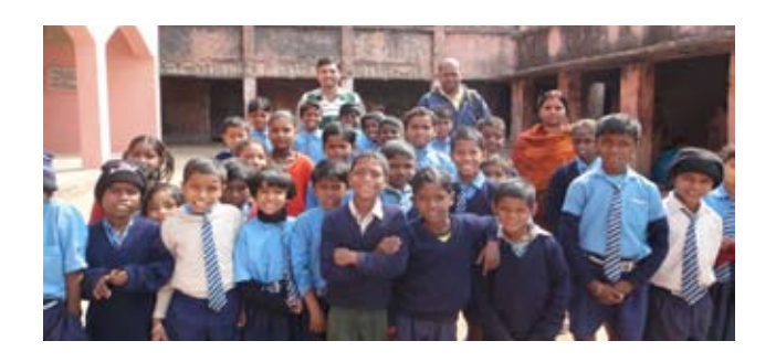
NLCP Special School, Guddri

their hailing from very poor background. This was possible because of the efforts taken by the NCLP Special School Teachers in educating parents on the importance of good habits and hygiene at every Parents-Teachers meetings held every Saturday. Children are also motivated and talked to on the importance of hygiene and cleanliness. This has resulted in the needed behavioral change. Parents are also happy to see their children voluntarily keeping themselves clean and taking care in dressing themselves up tidily.