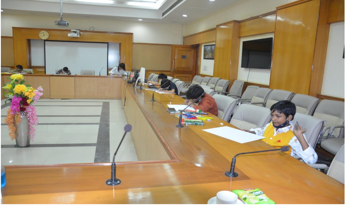
स्वतंत्रता सेनानियों के योगदान पर भाषण (24 सितम्बर 2021) Elocution on contribution of Freedom fighters (24 September 2021)